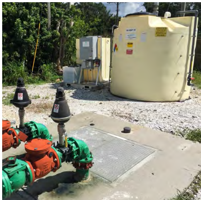
Alkagen AQ Solution provides fast-acting sulfide control

Alkagen AQ Solution is fast-acting and rapidly dissolves in wastewater, providing an almost instantaneous effect at the application point. This contrasts to magnesium hydroxide, which has to be added upstream to allow time for dissolution, sometimes requiring multiple feed sites.